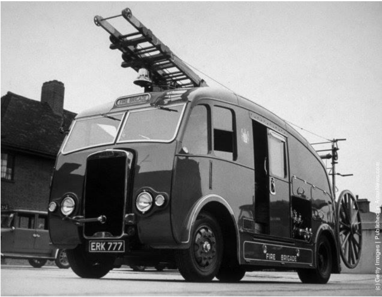
(c) Getty Images | Published in: AwaNews.com