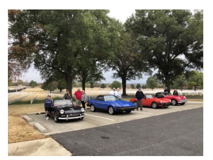
A visit to the National Cemetery in Ft. Gibson