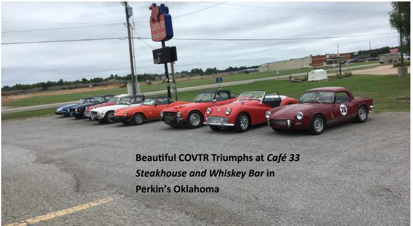
Beautiful COVTR Triumphs at Café 33 Steakhouse and Whiskey Bar in Perkin's Oklahoma