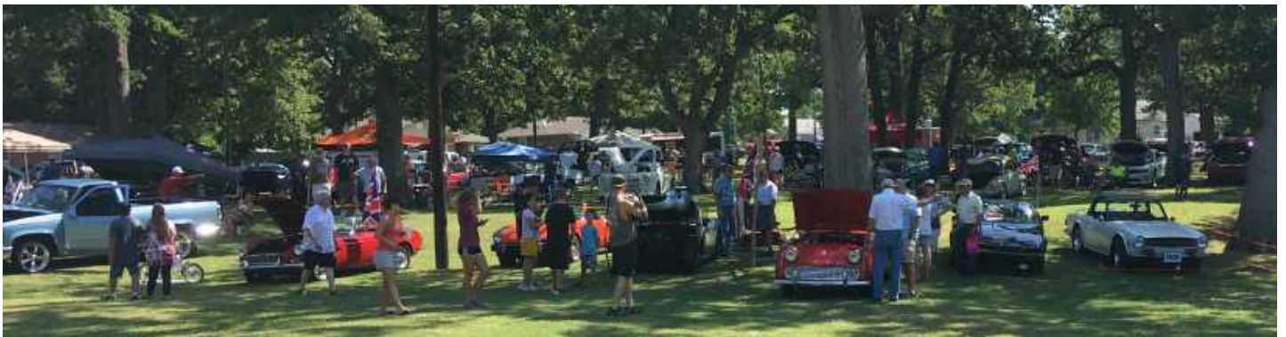
Same photograph...different angle