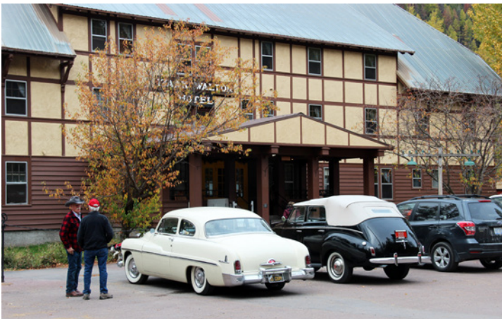
Lunch time at Izaak Walton Inn

So that's the news from Billings. See you down the road.