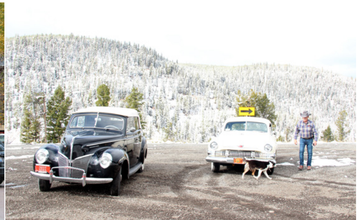
Lost Trail Pass with a little snow.