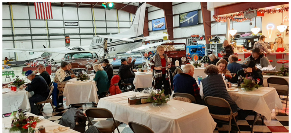
Christmas party at Jack's Hangar