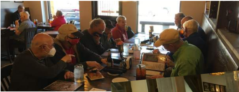
in the upcoming VTR National Convention.