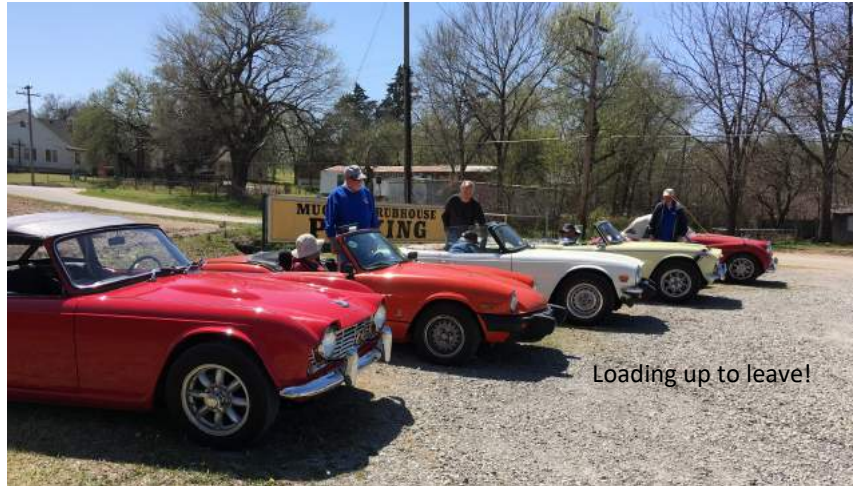
Loading up to leave!