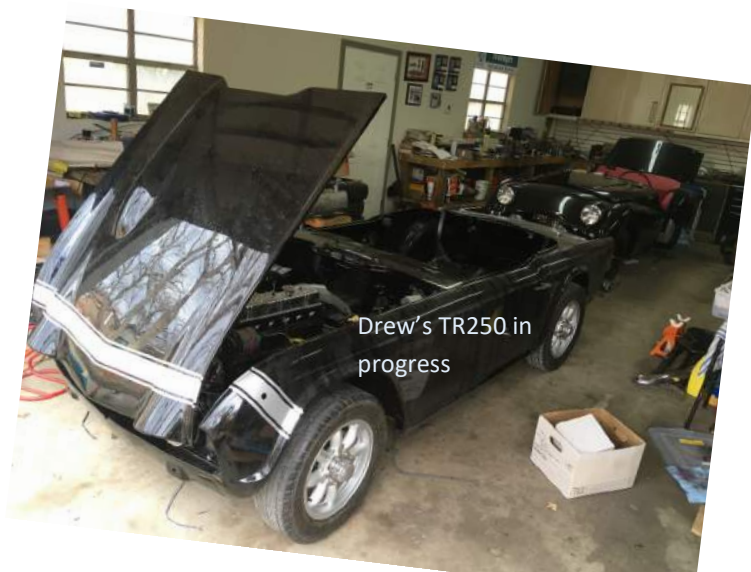
Drew's TR250 in progress

Perhaps there we can get a group photo of all six COVTR TR 250s!