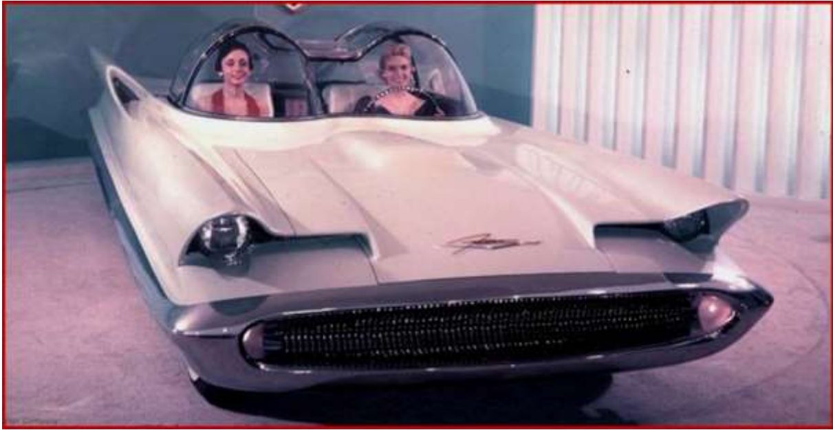
1955 LINCOLN FUTURA