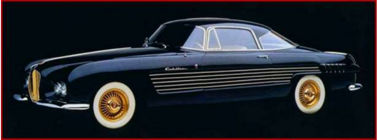
> 1953 CADILLAC GHIA COUPE