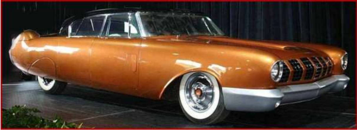
> 195? MERCURY D524

> This car was never shown to the public.