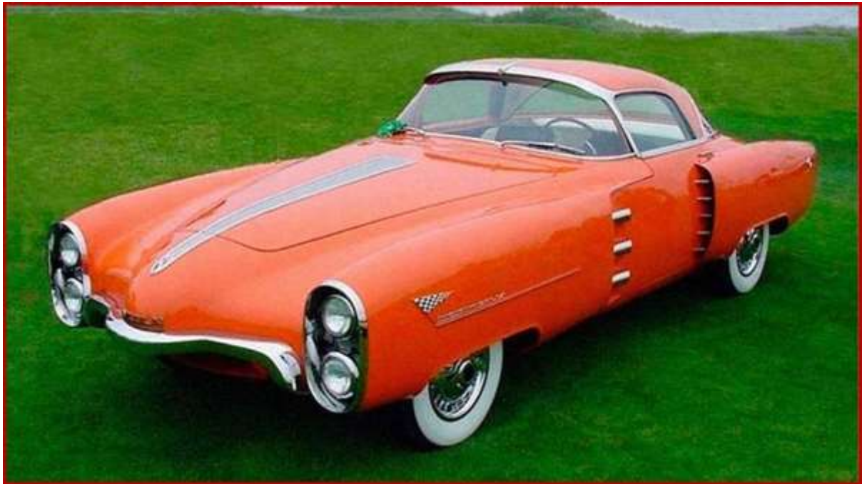
> 1955 LINCOLN INDIANAPOLIS