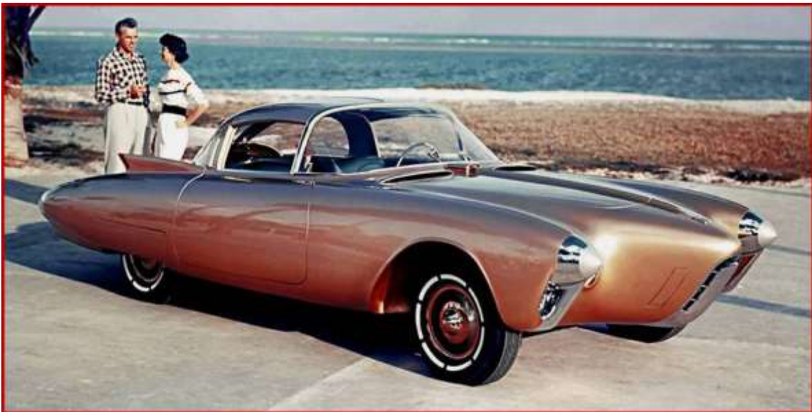
> 1956 OLDSMOBILE GOLDEN ROCKET