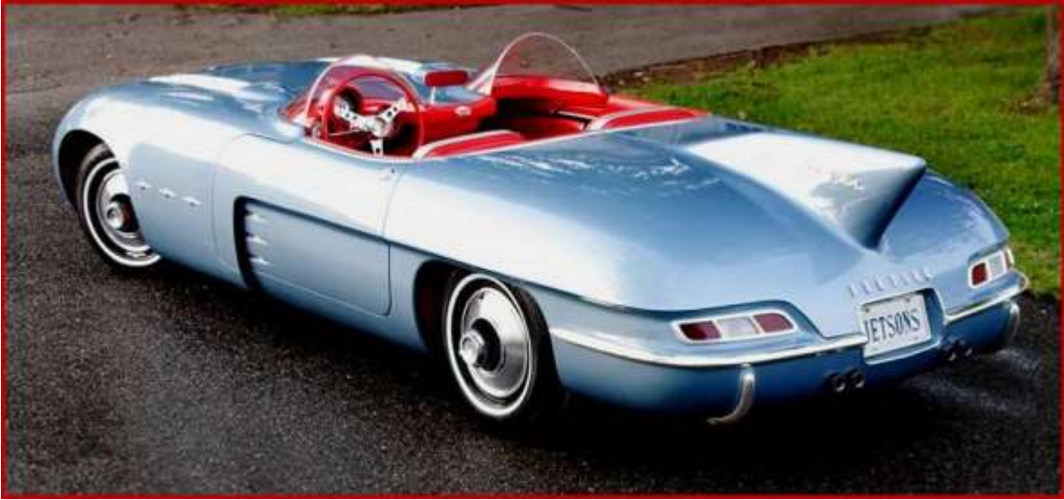
> 1956 PONTIAC CLUB DE MER