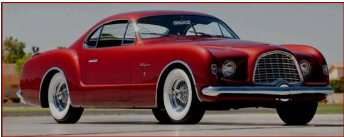
> 1952 CHRYSLER D'ELEGANCE

> This car was never shown to the public.