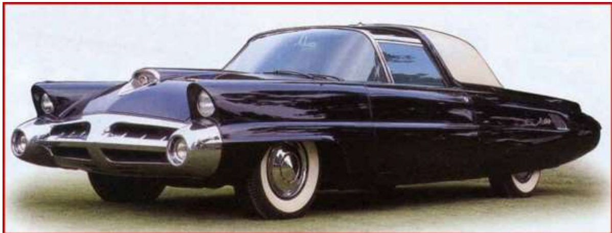
> 1953 FORD X-100