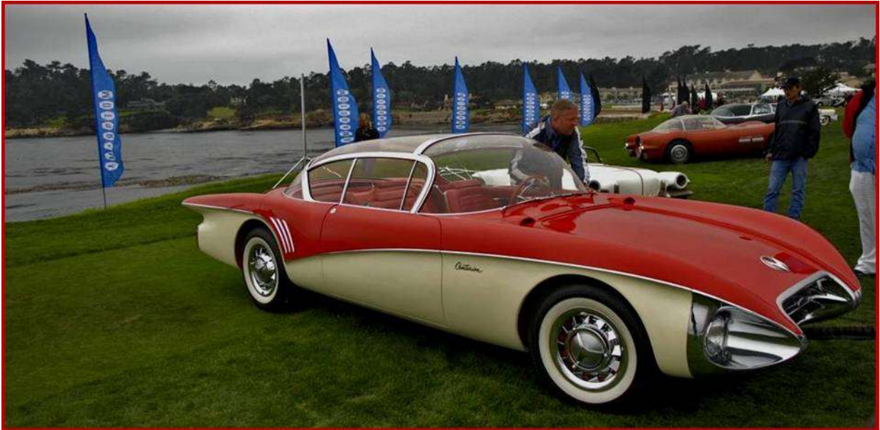
1956 BUICK CENTURION II