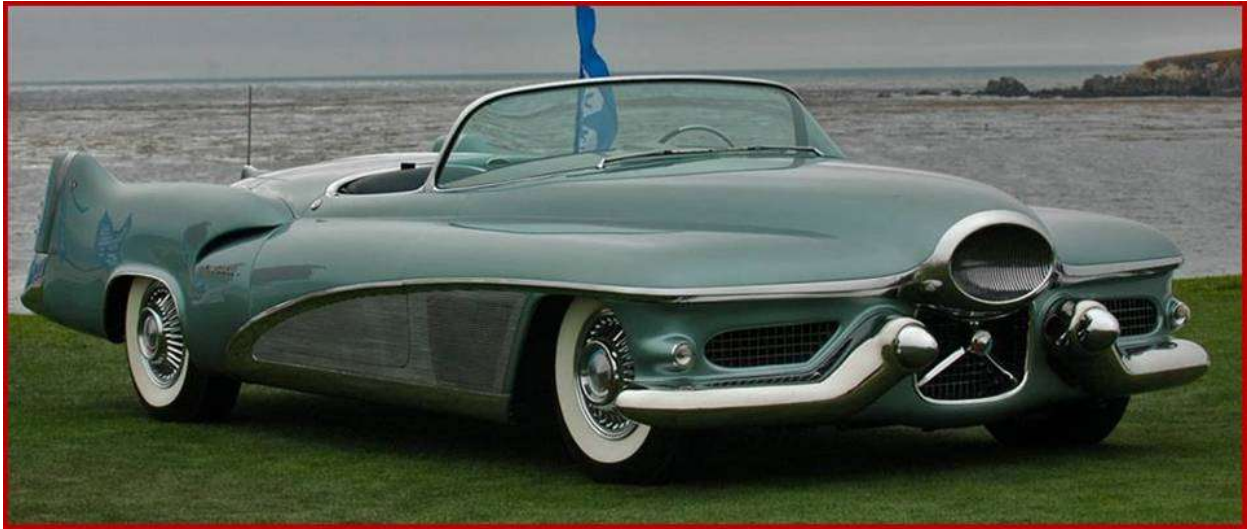
1951 BUICK LeSABRE