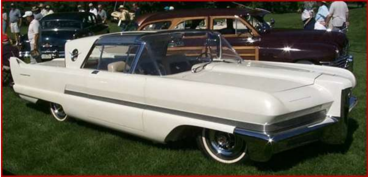
> 1956 PACKARD PREDICTOR