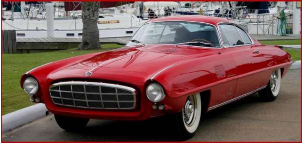
> 1954 DE SOTO ADVENTURER II