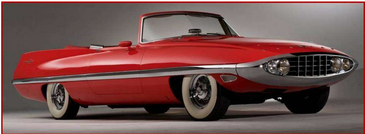
1957 CHRYSLER DIABLO

test wild engineering ideas and give motorists a fleeting glimpse down the highway of tomorrow.