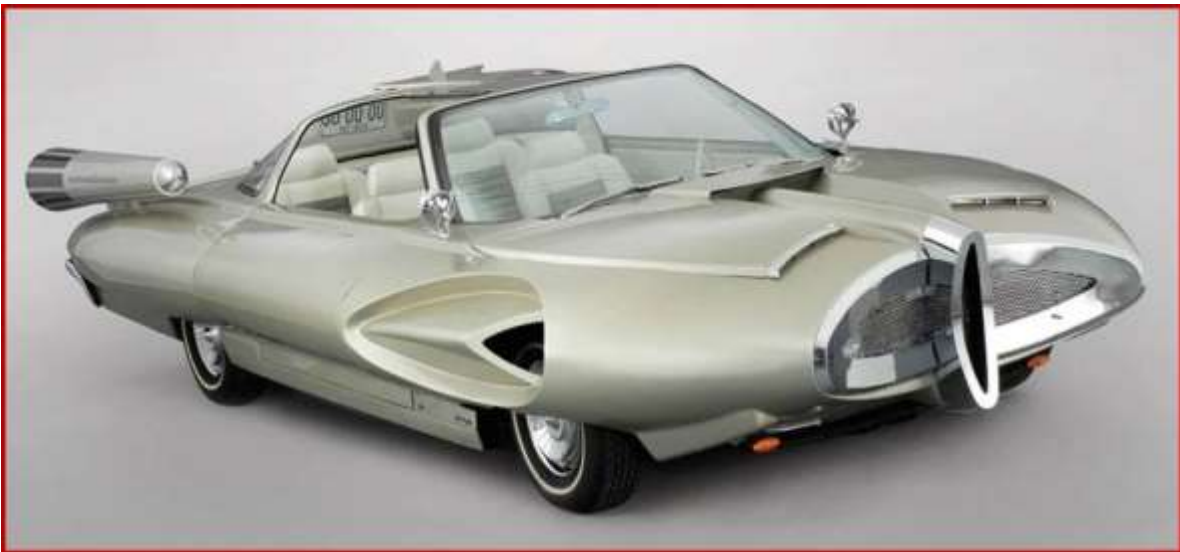
1958 FORD X-2000