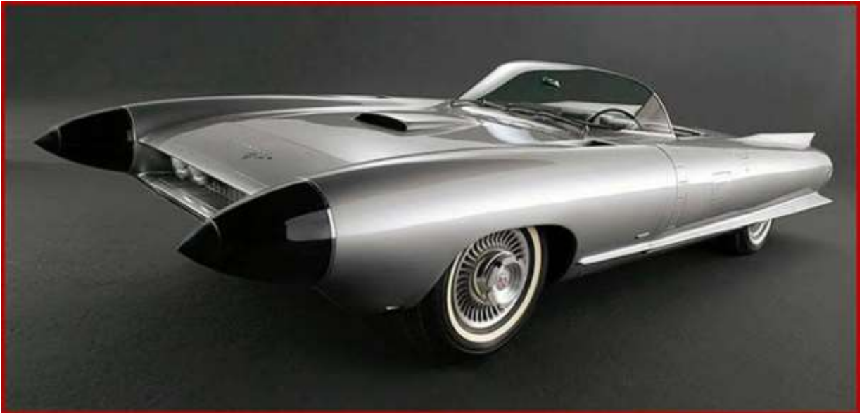
1959 CADILLAC CYCLONE